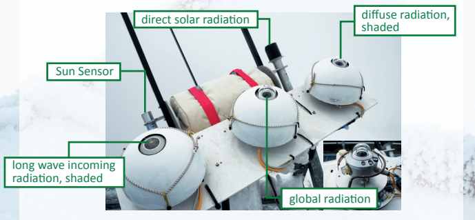
Fig.2: Typical ARAD station: Suntracker with different radiation sensors.

The sensors are mounted on a suntracker, which allows correct tracking of the solar path and guarantees the continuous alignment of the pyrheliometer to incoming direct solar radiation. The suntracker also ensures continuous shading of the pyranometer for recording scattered shortwave radiation and of the pyrgeometer to measure incoming long wave radiation.