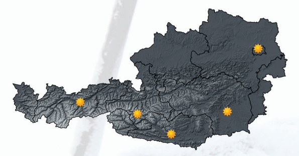
Fig. 1: Location of the ARAD radiation measurement stations in Austria.

The sun is the main "driver" for our weather and strongly influences the climate on earth over long periods of time. It sends a spectrum of electromagnetic waves, from radio waves to visible light to x-rays that cause diverse interactions with the earth's atmosphere. Radiation is an energy transfer in the form of electromagnetic waves, which can propagate in a vacuum as well as in an air filled volume like the earth's atmosphere. That is why solar radiation reaches the ground after travelling through space. For the climate system of the earth, two types of radiation are of special importance: solar and thermal radiation. Solar radiation comes either directly from the sun, or indirectly via scattering in the earth atmosphere. Thermal or infrared radiation is emitted by all bodies on the earth as a function of its temperature. Electromagnetic waves of solar radiation are much shorter and thus have a higher energy than thermal radiation. That is why they are called short- (solar) and long wave (thermal) radiation.