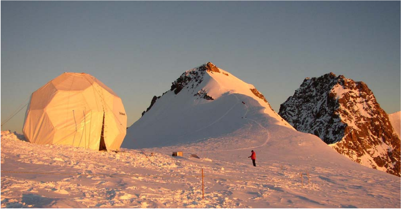
Figure 3: Panoramic view on drill dome, Zumstein (4563 m asl) and Dufour-Spitze (4634 m asl)