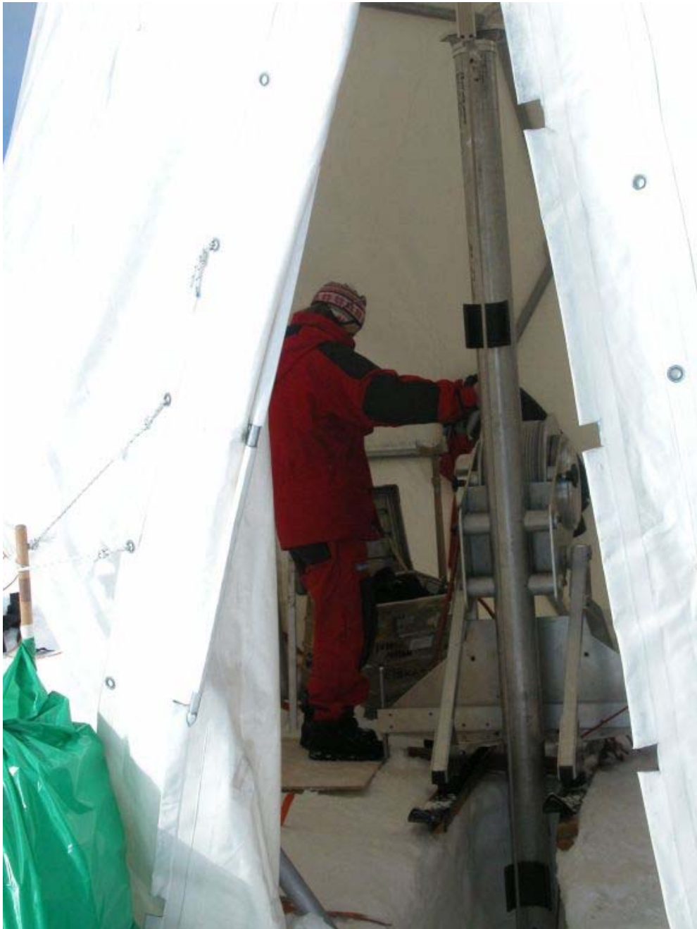
Figure 4: View on drill of the Physical Institute Berne placed within the drill dome