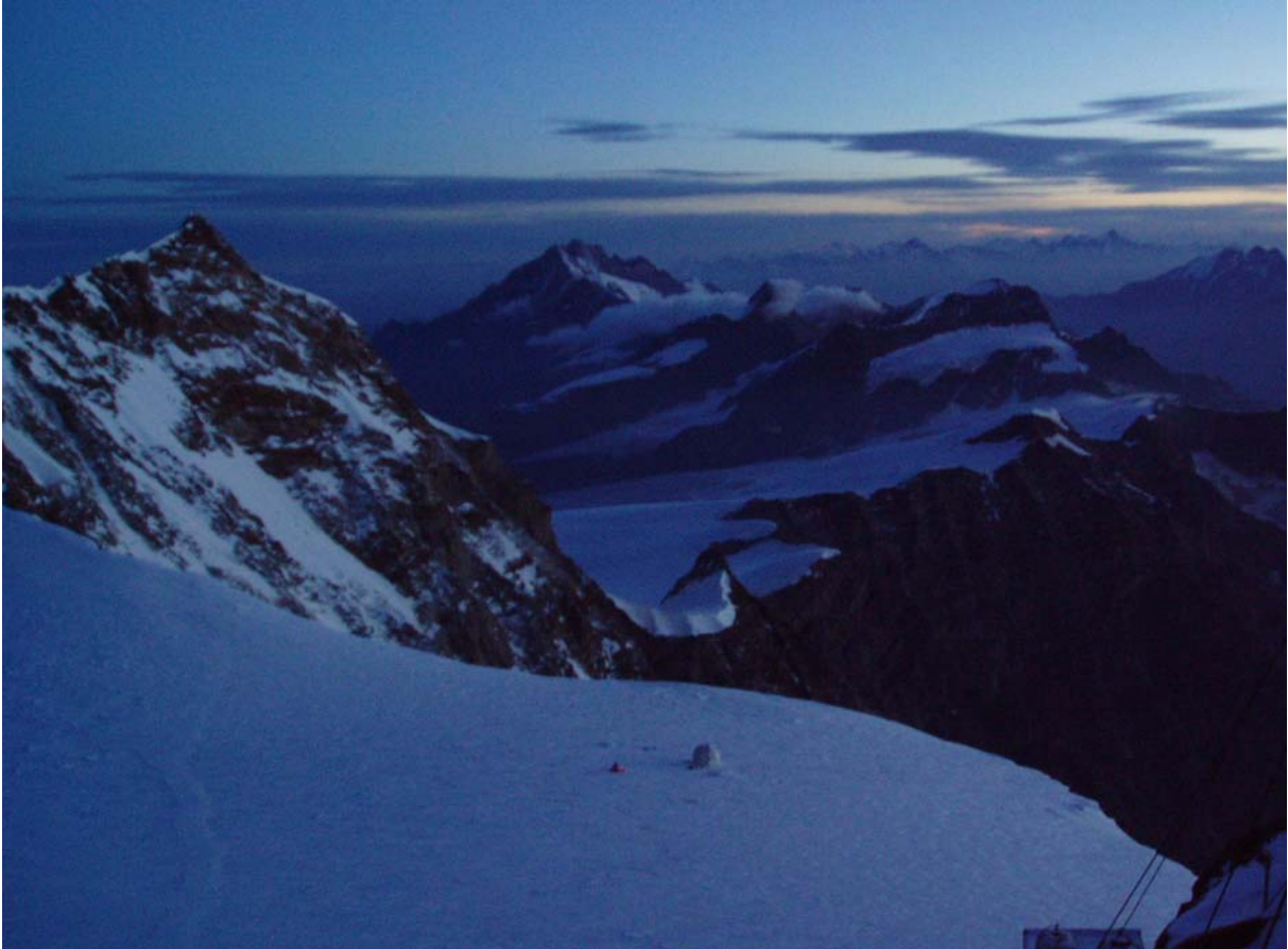
Figure 1: Position of the 2005 drill camp close to ice cliff at top of the eastern rock face of the Monte Rosa massif