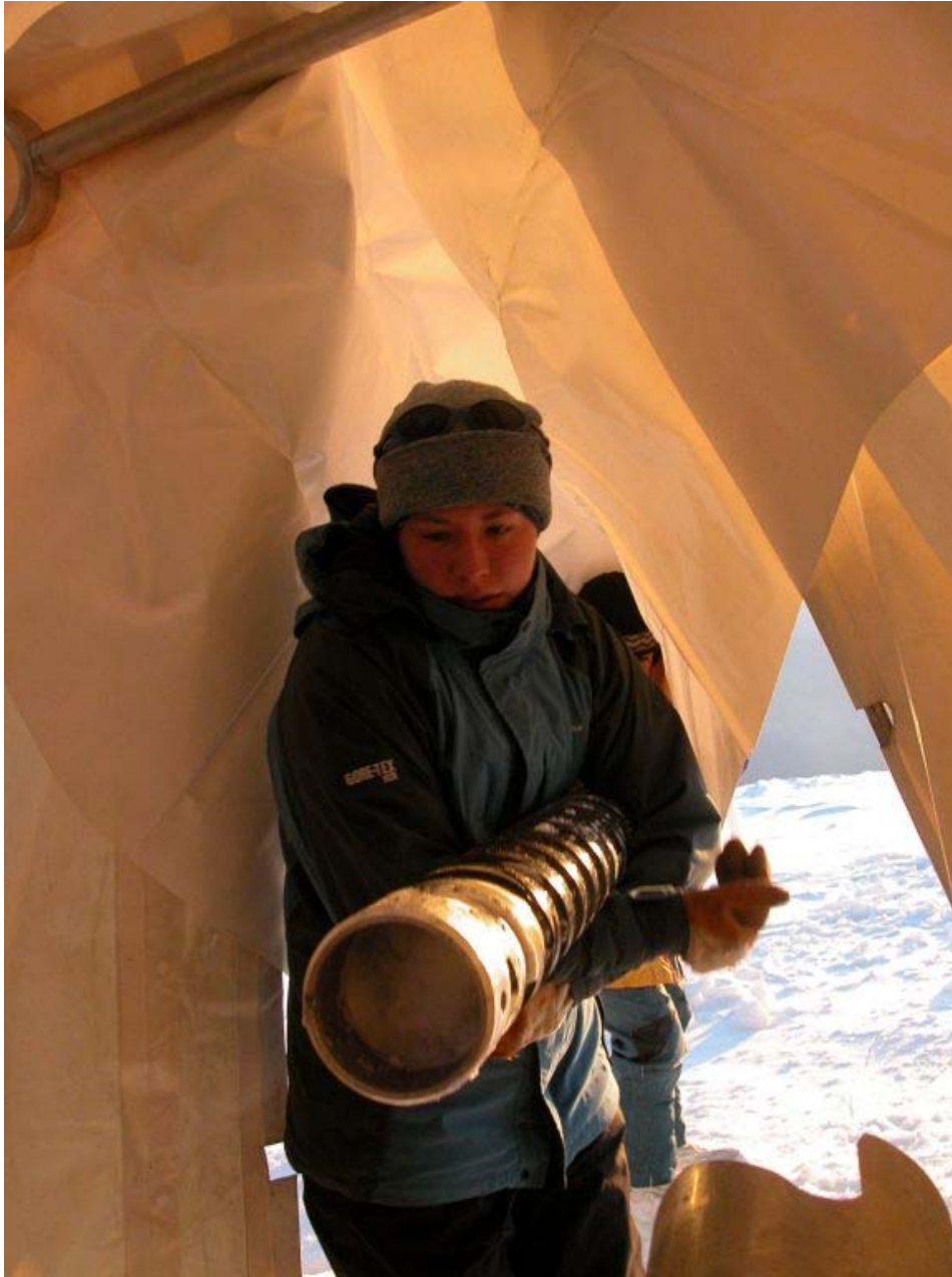
Figure 5: Core barrel still filled with drilled ice