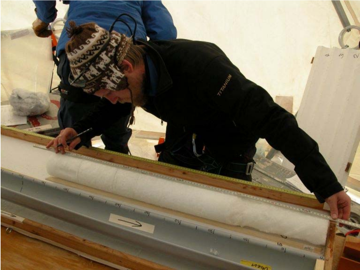
Figure 6: Processing of a crumbly firn core from near the surface